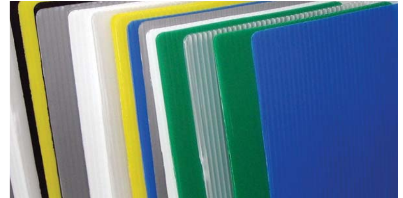
Cgate Fluted Polypropylene in a variety of colours