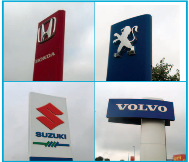
Common signage applications using Cbond

Uses for Cbond are limited only by the imagination. Panels are produced in a wide range of colours and finishes, including metallic, and in thicknesses to suit practically any application.