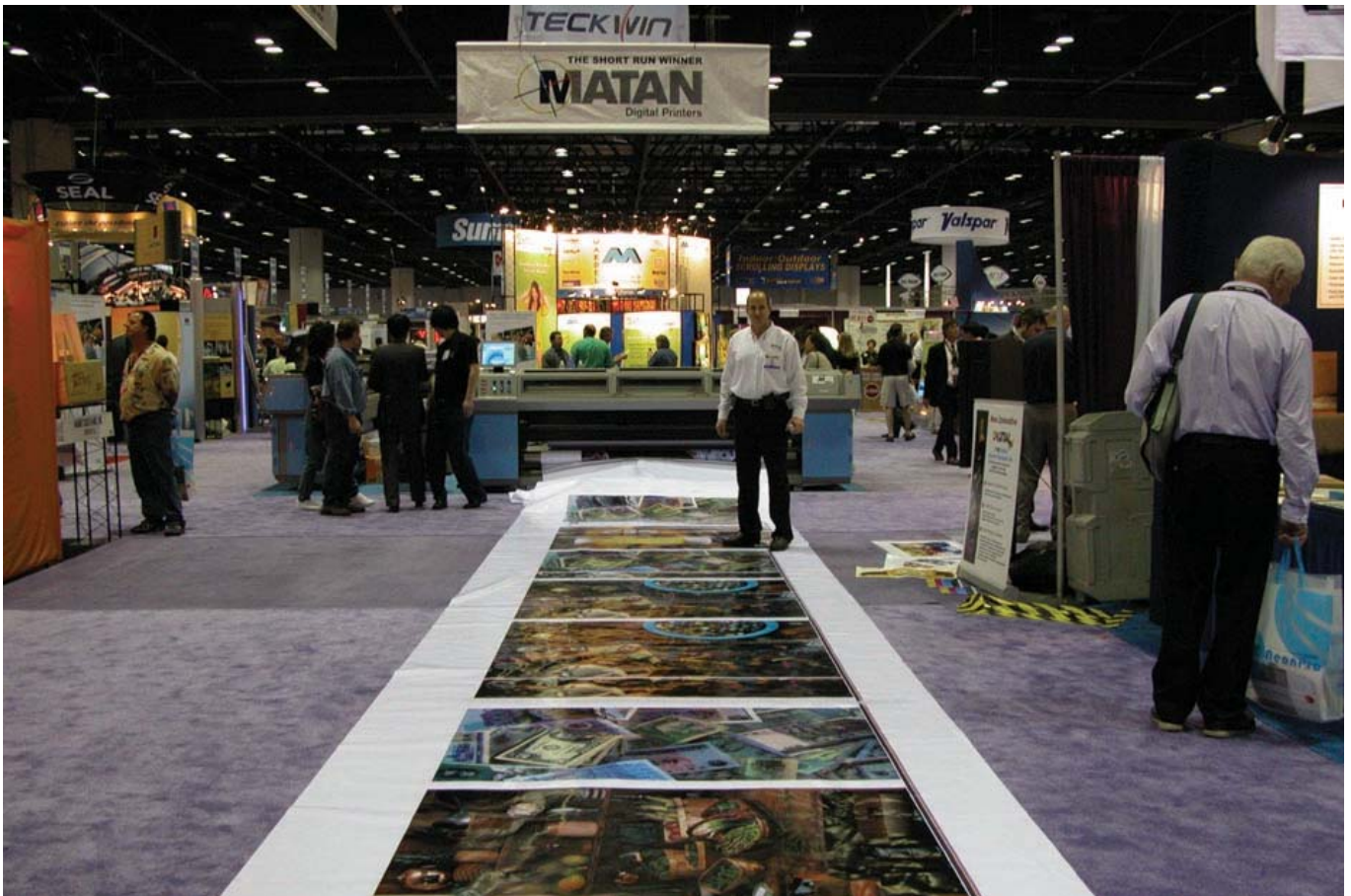
Cgate frontlit solvent media at ISA, Florida.