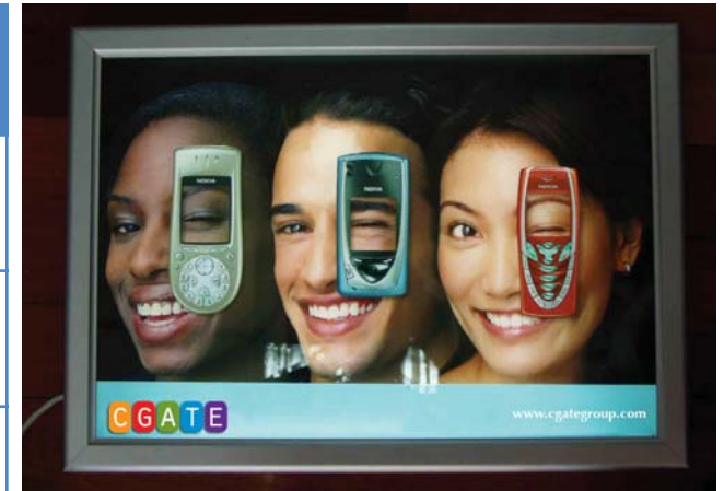
clear vibrant image