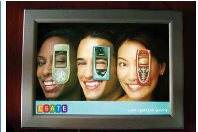
clear vibrant image