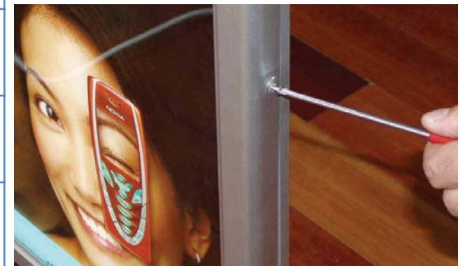
easy screw close